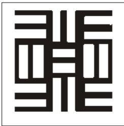
Akan knowledge symbol: Nea onnim , "The one who does not know"