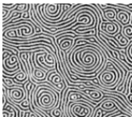
Figure 2. Rayleigh-Bénard convection cells in pressurized carbon dioxide, imaged from above. White and black indicate opposite upward and downward flow respectively.

Here the motion of individual particles in the fluid is due much less to their microphysical interactions than to the spontaneously established macroscopic patterns.