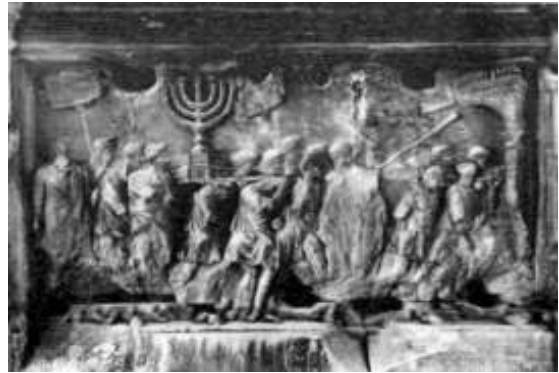
This bas-relief depicts Roman troops carrying the menorah and other sacred loot from the temple in the year 70. The claims that the mission to the Jews ended at this time is sociologically improbable.

NOTHING seems more self-evident than the proposition that the rise of Christianity was accomplished despite the failure of the mission to the Jews. The New Testament says so, and so does the uncontested weight of historical and scholarly opinion. Granted, the received wisdom recognizes that Jews made up the bulk of very early converts, as phrases such as “Jewish Christianity” and “the Christian Synagogue” acknowledge. But it is generally assumed that this pattern ended abruptly in the wake of the revolt of 66-74, although some writers will accept a substantial role for Jewish conversion into the second century, regarding the Bar-Kokhba revolt as the “final straw” in Jewish-Christian sympathies.